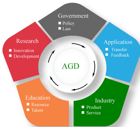
Fig. 3 The collaboration of different stakeholders to realize Agricultural Green Development (AGD).

To achieve regional objectives for AGD, CAU has