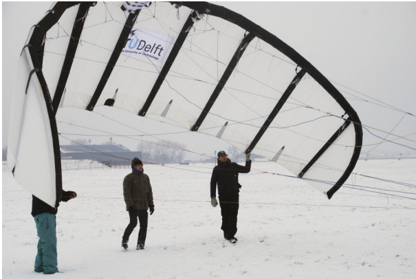
Fig. 1. In 2013, aerospace engineering graduate students in the Netherlands launch a 25 m 2 , experimental, soft-wing energy kite as the tug of a winch on its tether opposes the wind force and helps the kite develop lift. Small flexible kites with simple curved designs familiar from wind sports have scaled up in the past decade to much bigger sizes than the kite pictured here. Those enlarged soft wings have proven suitable for mostly powerful AWE systems for niche uses, such as the first commercially sold system purchased from German company SkySails in November 2020 by the island-nation Mauritius [7]. More complex and difficult to predict or control motions of still larger, stronger soft-wing AWE kites remain subject to further research and testing.

now becomes the rigid-wing AWE developer with the highest power, operational prototype in the field. Its newest 150 kW, AP3 drone began light-wind test flights in Spain in December 2020 [11]. Observing that the company released a new, dramatic video to attract investors in December 2020 [12], Schmehl said he suspects Ampyx will replace Makani as AWE's most conspicuous developer.